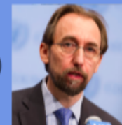
Mr. Zeid Ra'ad Al Hussein High Commissioner for Human Rights