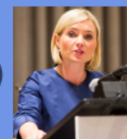
Lilja Dagg Alfreðsdóttir Minister for Foreign Affairs and External Trade of Iceland